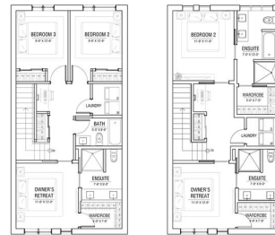
UPPER FLOOR OPTION 1 ± 760 SQ.FT.