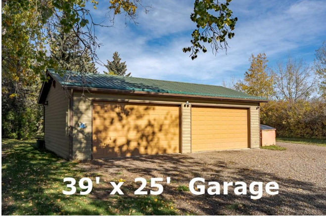
39' x 25' Garage