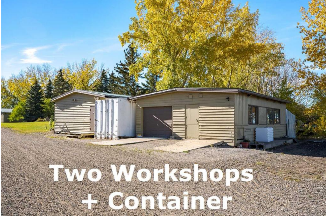
Two Workshops + Container