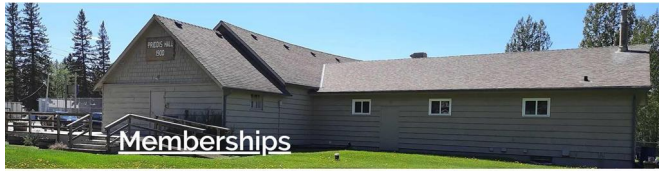
Priddis Community Association