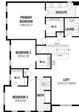
mattamy HOMES Norquay – Second Floor

Unselected Options: 4th Bedroom w/ Loft, Bath Oasis, Dual Primary Bedroom w/ Third Bedroom, Dual Primary Bedroom w/ Loft