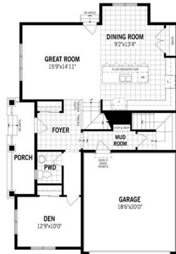
mattamy HOMES Norquay – Main Floor

Unselected Options: Main Floor Bedroom, Side Door Entry