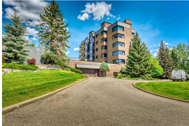
5N-222 Eagle Ridge Dr SW, Calgary, AB Main Floor Interior Area 2019/27 sq ft