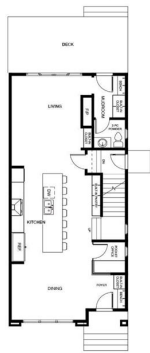
605 11 AVENUE NE | MAIN

Disclaimer: Floorplans are for descriptive purposes and should not be relied upon without independent verification. Room dimensions and floor areas are approximate and should be treated as estimates only.