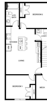
605 11 AVENUE NE | LOWER

Disclaimer: Floorplans are for descriptive purposes and should not be relied upon without independent verification. Room dimensions and floor areas are approximate and should be treated as estimates only.