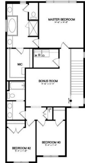
UPPER FLOOR - 1170 SQFT