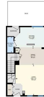
Main Floor Exterior Area 551.99 sq ft

Main Building: Total Exterior Area Above Grade 1140.87 sq ft