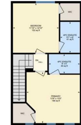
1st Floor Exterior Area 588.88 sq ft