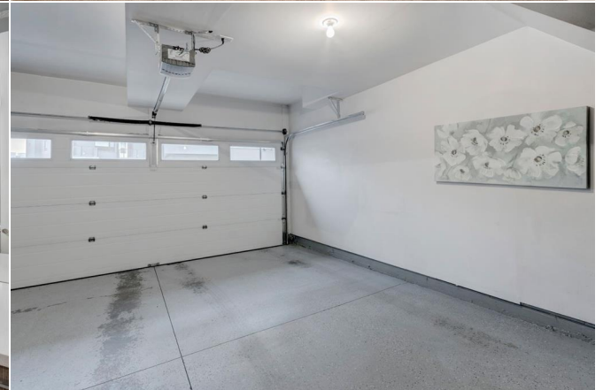
801-218 Sherwood Sq NW, Calgary, AB

Entry Level Exterior Area 252.20 sq ft Interior Area 221.65 sq ft Excluded Area 255.18 sq ft