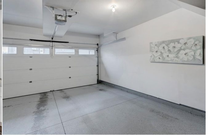
801-218 Sherwood Sq NW, Calgary, AB

Entry Level Exterior Area 252.20 sq ft Interior Area 221.65 sq ft Excluded Area 255.18 sq ft