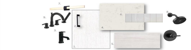
1.Vanity Cabinets 2.Cabinet Hardware 3.Vanity Faucet 4.Quartz Countertop 5.Floor Tile 6.Back Splash Tile 7.Vanity Light 8.Shower Faucets 9.Tub Faucets