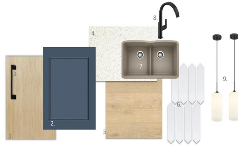
1.Perimeter Cabinetry 2.Island Cabinetry 3.Cabinet Hardware 4.Quartz Countertop 5.Laminate Flooring 6.Tile Backsplash 7.Kitchen Sink 8.Faucet 9.Island Pendants

Sage Essence Spec 52 Creekview Manor Ensuite Bathroom July 2024