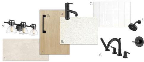
1.Floor Tile 2.Vanity Cabinet 3.Vanity Hardware 4.Vanity Faucet 5.Quartz Countertop 6. Tub Faucet 7.Vanity splash & wall tile 8.Shower Faucet 9.Vanity Light