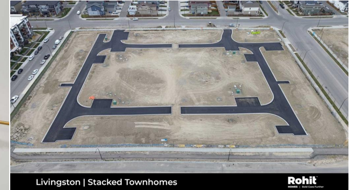
Livingston | Stacked Townhomes