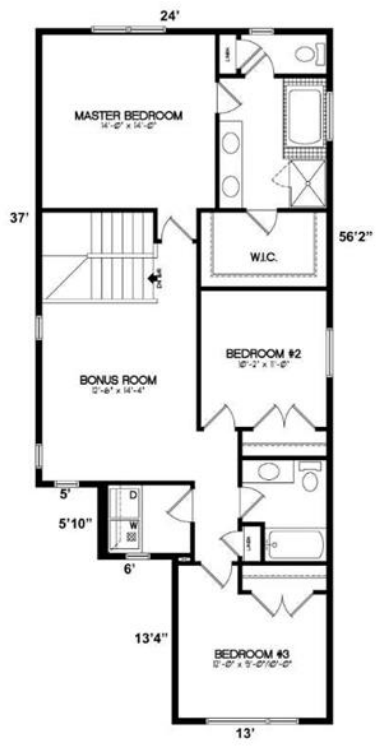
UPPER FLOOR - 1109 SQFT