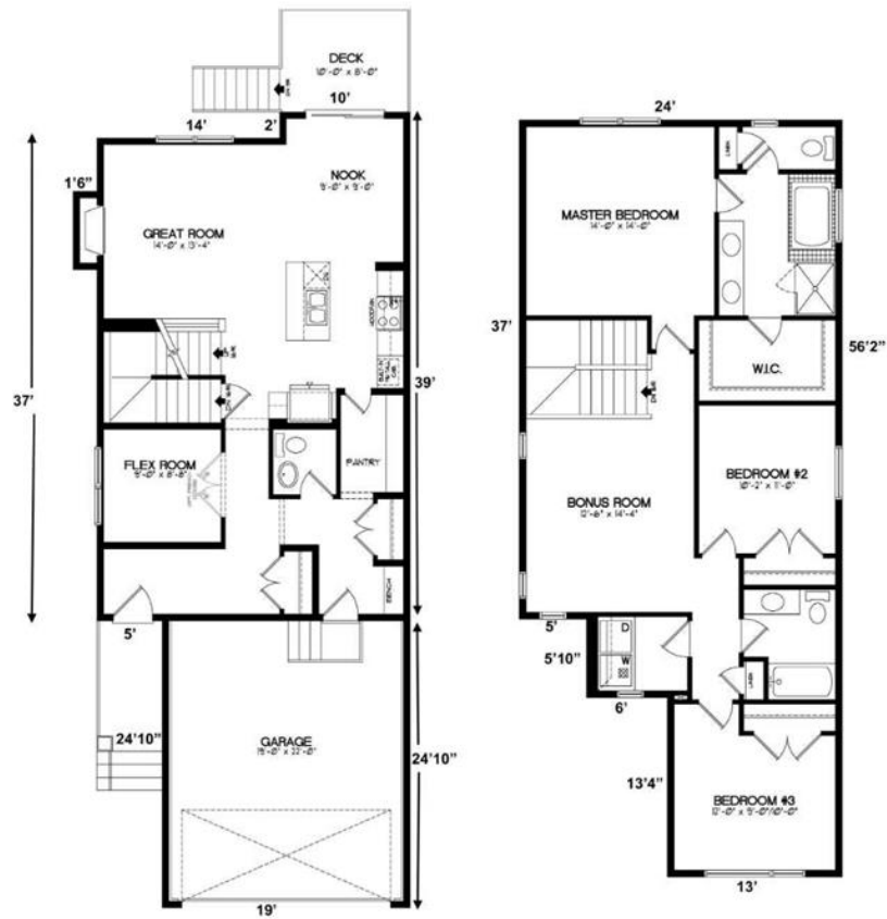
MAIN FLOOR - 908 SQFT