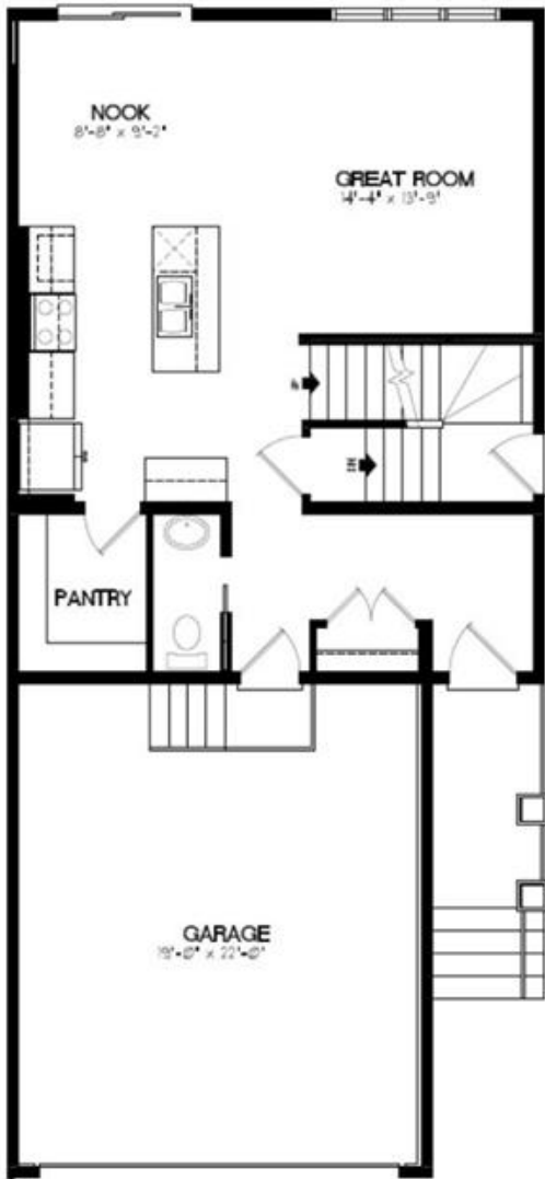
MAIN FLOOR - 720 SQFT