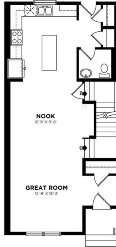
MAIN FLOOR - 773 SQFT