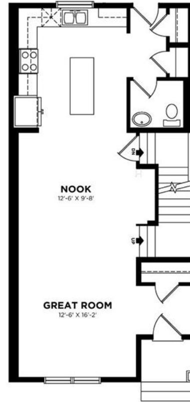
MAIN FLOOR - 773 SQFT