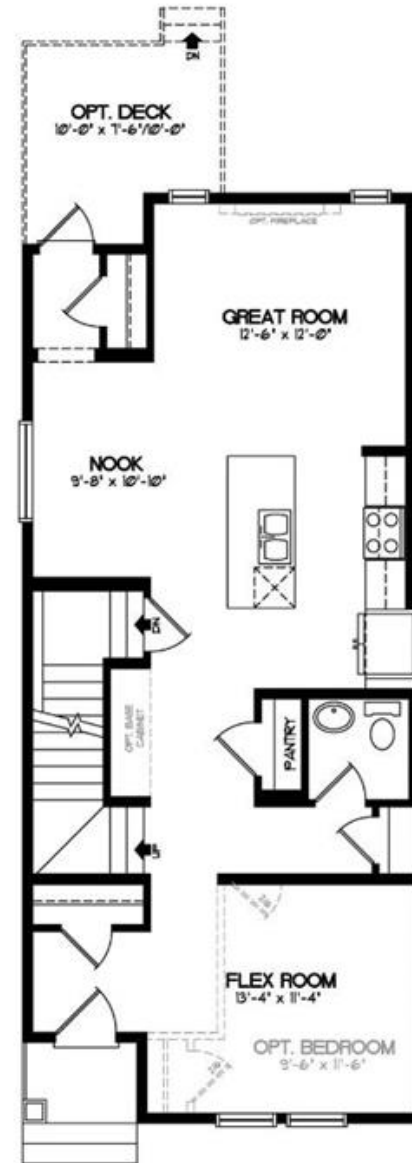
MAIN FLOOR - 882 SQFT