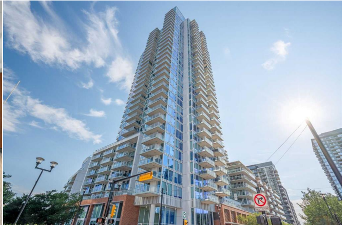
510 6 Ave SE, Calgary, AB Main Floor Exterior Area 110,96 sq ft