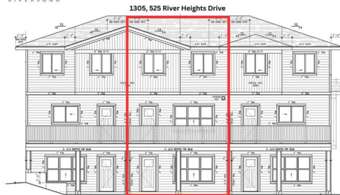
Walk Out Rear Elevation