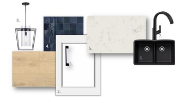
1. Laminate Flooring 2. Kitchen Cabinetry 3. Cabinet Hardware 4. Tile Backsplash 5. Quartz Countertop 6. Kitchen Sink 7. Faucet 8. Peninsula Pendant

BayWest Homes is a registered trademark of BayWest Homes, Inc. All rights reserved. © 2024 BayWest Homes, Inc. All other trademarks are the property of their respective owners. This document is for informational purposes only and does not constitute an offer. Please contact your local sales representative for more information.