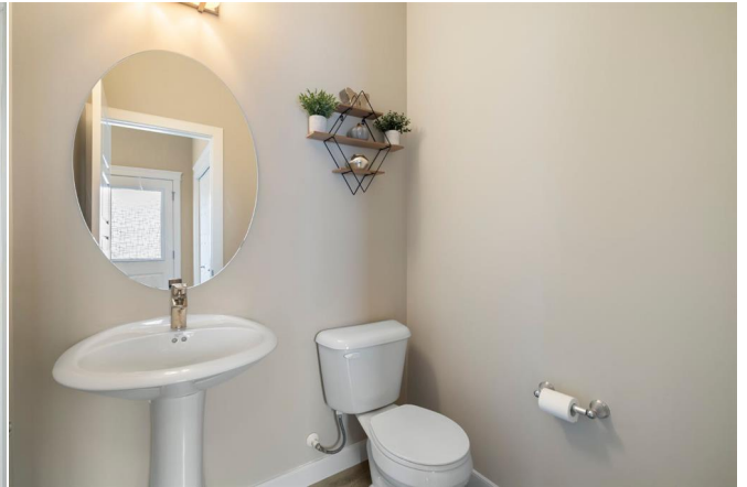
133 Evanston Hill NW, Calgary, AB Main Floor Exterior Area 723.76 sq ft