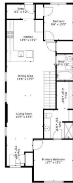
TOTAL 1857 sq. ft. BELOW GROUND: 873 sq. ft. FLOOR 2: 982 sq. ft. EXCLUDED AREAS: UTILITY: 157 sq. ft.

Floor Plan Created by CoHome App. Measurements Deemed Highly Accurate But Not Guaranteed.