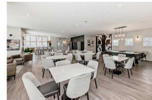
red haus offers a renovated lounge/recreation space & a fully equipped gym.