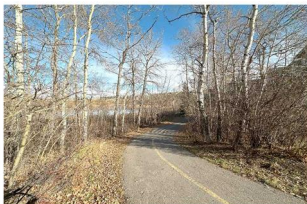
walkable to numerous amenities - ponds, pathways, schools, parks & much more.