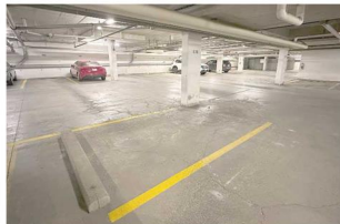
titled underground corner parking stall, tiled storage & indoor bike storage.