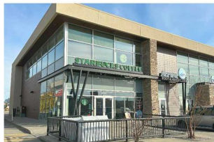
the shops, services & restaurants at royal oak shopping centre are just across the road.