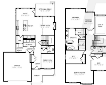
MAIN LEVEL 1,324 sq. ft.