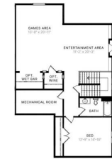
BASEMENT LEVEL 960 sq. ft.