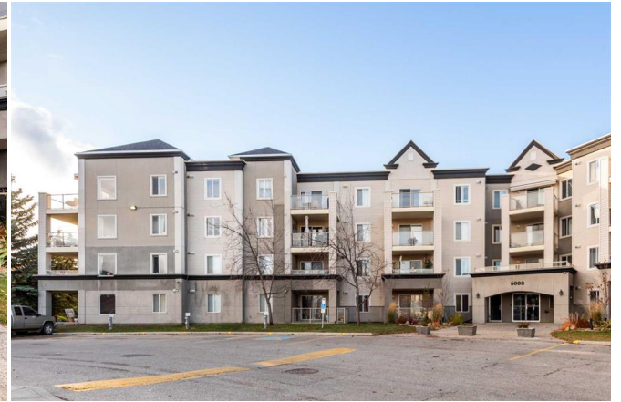
317-6000 Somervale Ct SW, Calgary, AB