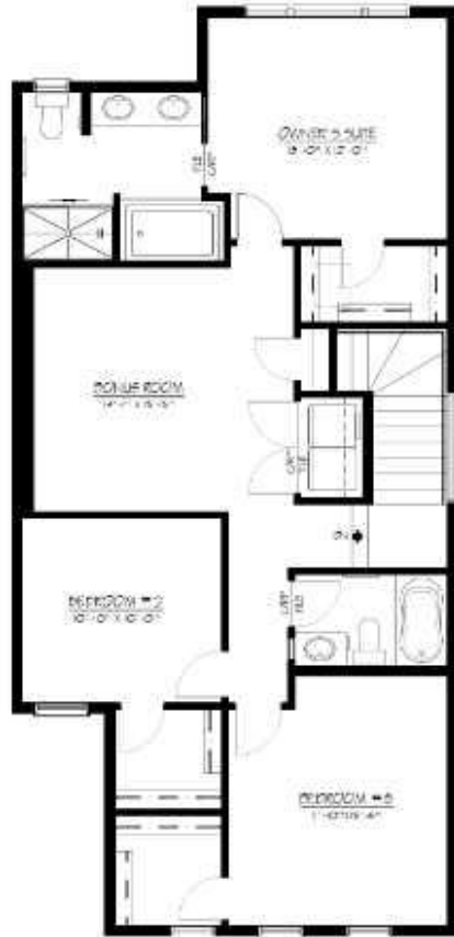
UPPER 1100 SQ.FT.