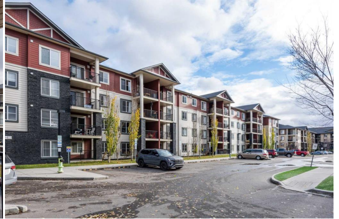
1335-81 Legacy Blvd SE, Calgary, AB