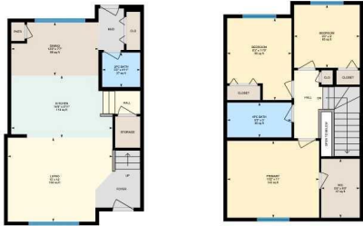
Main Floor Exterior Area 584.61 sq ft

Main Building Total Exterior Area Above Grade 1190.12 sq ft