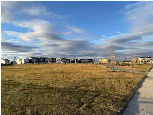
The CARTER Bold Designer Duplex 3 Bed 2.5 Bath 1475 sq ft