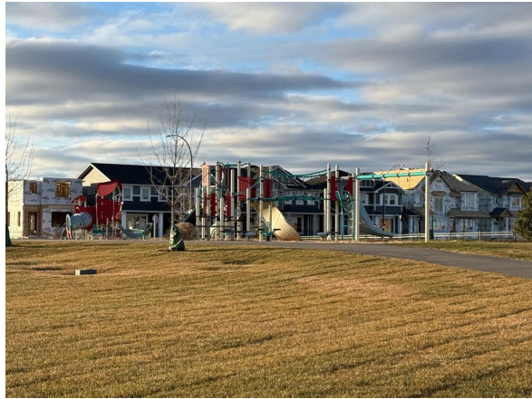
The CARTER Bold Designer Duplex 3 Bed 2.5 Bath 1475 sq ft