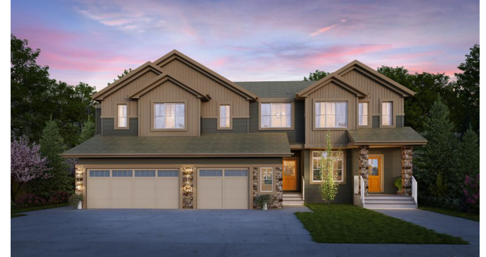
SORA AT HOTCHKISS Bold Designer Homes Project Features