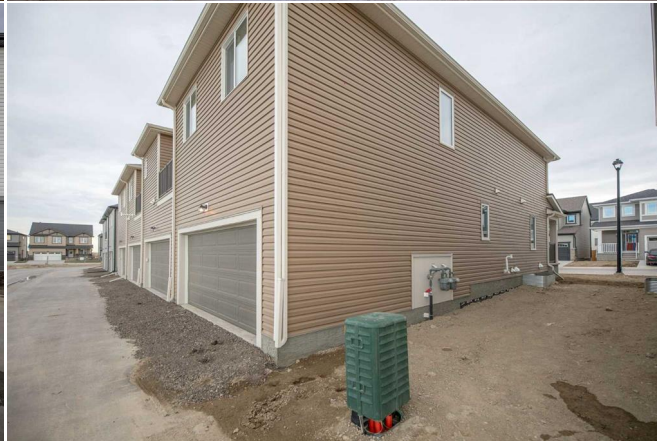
1017-Southwinds Grn SW Southwinds Grn SW, Airdrie, AB Upper Level: Exterior Area 50.38 sq ft Interior Area 83.52 sq ft