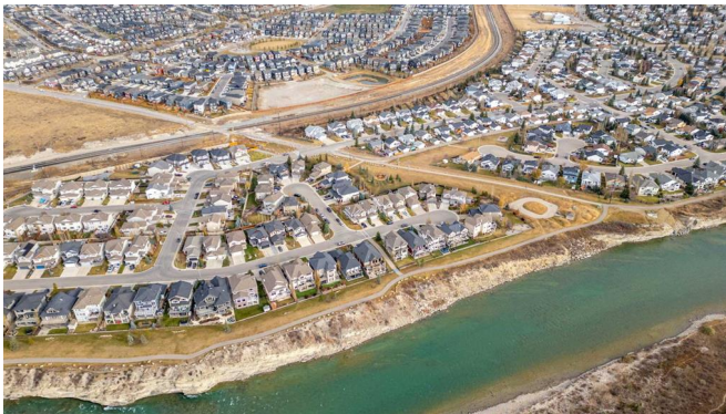
108 W Pointe Manor, Cochrane, AB

Basement (Below Grade) Exterior Area 1026.56 sq ft Interior Area 952.41 sq ft