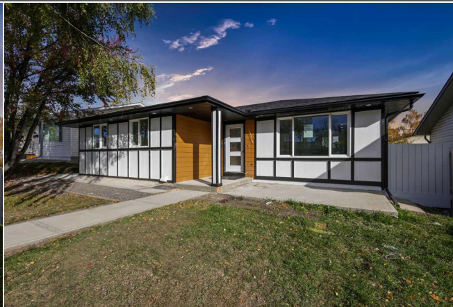
8020 Huntwick Hill NE, Calgary, AB T2K 4H1 Main Floor