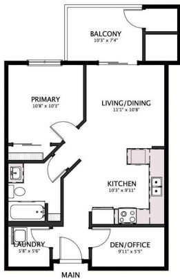
323, 345 Rocky Vista Park NW