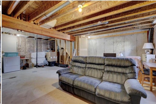
1587 Windstone Rd SW, Airdrie, AB

2nd Floor Exterior Area 620.87 sq ft Interior Area 622.13 sq ft