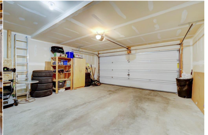
1587 Windstone Rd SW, Airdrie, AB

Basement (Below Grade) Exterior Area 539.95 sq ft Interior Area 179.05 sq ft