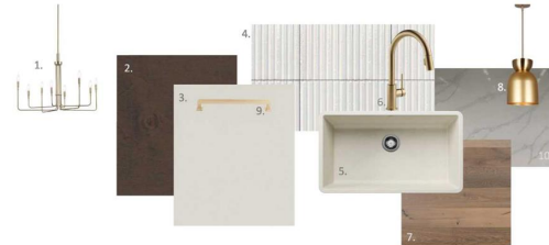
1.Dining Room Fixture 2.Kitchen Island Cabinetry Colour 3.Kitchen Perimeter Cabinetry Colour 4.Tile Backsplash 5.Sink 6.Faucet 7.Hardwood Flooring 8.Island Pendants 9.Cabinet Hardware 10.Quartz Countertop