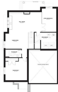
Model B Ground Floor Plan