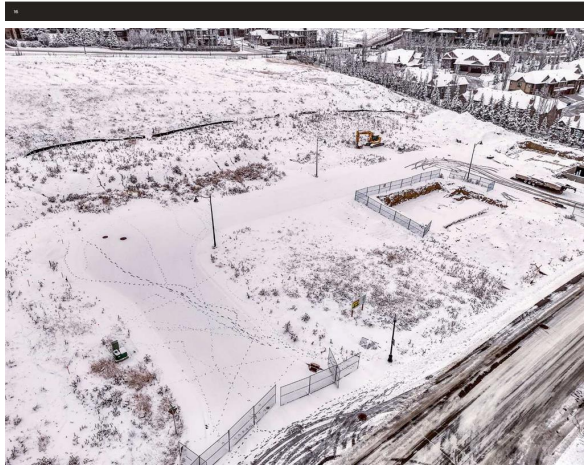
Model B Prairie