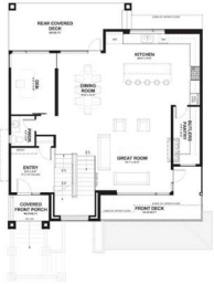
Model A Second Floor Plan