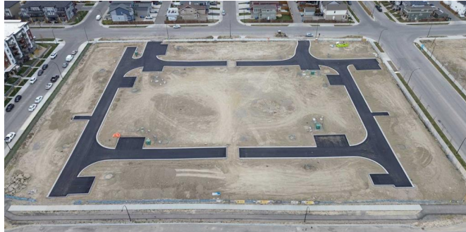
Livingston | Stacked Townhomes Rohit HOMES | Bold Goes Further