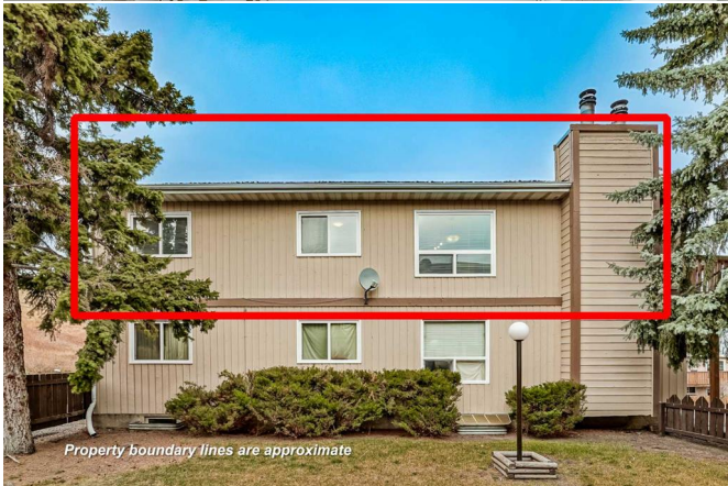
Property boundary lines are approximate