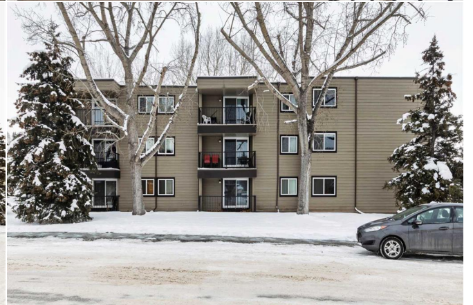
306-36 Glenbrook Crescent, Cochrane, AB