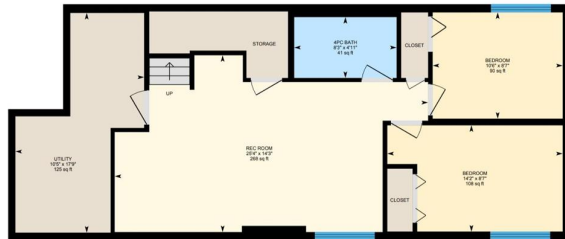
PREPARED: 2024/12/04 White regions are excluded from total floor area in GUIDE floor plans. All room dimensions and floor areas must be considered approximate and are subject to independent verification. GUIDE