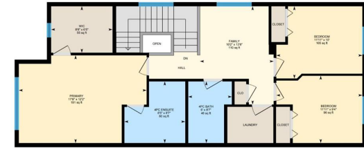
PREPARED: 2024/12/04 White regions are excluded from total floor area in GUIDE floor plans. All room dimensions and floor areas must be considered approximate and are subject to independent verification. GUIDE