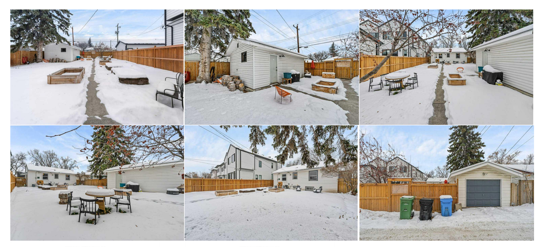
2536 4 Ave NW, Calgary, AB Main Floor Exterior Area 839.34 sq ft