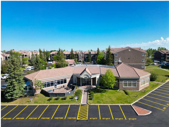
The Edgecliffe Club