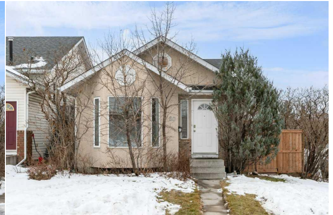
80 Rivercrest Crescent SE, Calgary, AB