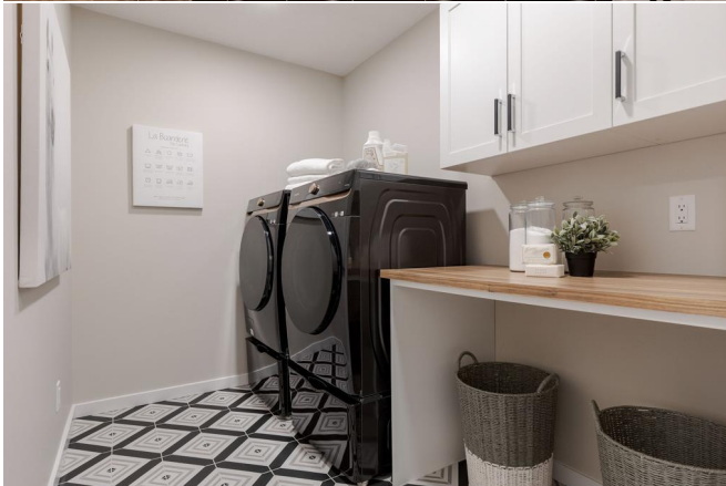
Job #7897 81 Walgrove Pl INTERIOR SELECTIONS FINAL PHOTO