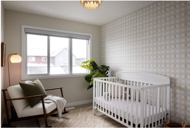
SORA Bold Designer Homes | Project Features