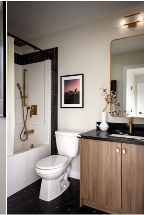
The TALO Bold Designer Townhome | 3 Bed, 2.5 Bath, 1506 sq ft