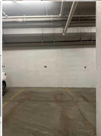
427-955 McPherson Rd NE, Calgary, AB Main Floor - Stair Area B17.37 sq ft