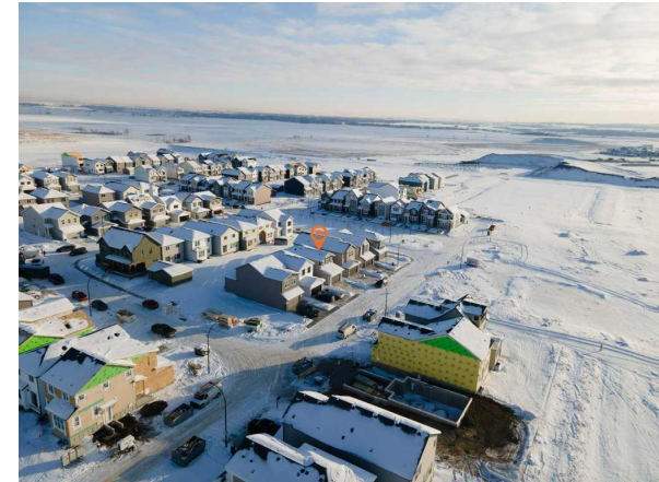
62 Sugarsnap Gdn SE, Calgary, AB

0 4 8 ft PREPARED: 2024/11/26 While regions are excluded from total floor area in GUIDE floor plans. All room dimensions and floor areas must be considered approximate and are subject to independent verification.