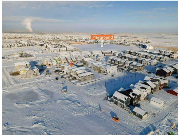
62 Sugarsnap Gdn SE, Calgary, AB

0 5 10 ft PREPARED: 2024/11/26 While regions are excluded from total floor area in GUIDE floor plans. All room dimensions and floor areas must be considered approximate and are subject to independent verification.