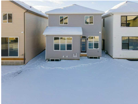
62 Sugarsnap Gdn SE, Calgary, AB

Main Floor Exterior Area 761.16 sq ft Interior Area 699.90 sq ft Excluded Area 487.27 sq ft