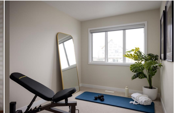
The TALO Bold Designer Townhome 3 Bed 2.5 Bath 1506 sq ft Upper Floor Features 10x10 TIT