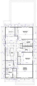
PROPOSED UPPER FLOOR PLAN SCALE: 1/4" = 1'-0" DATE: 10/15/2024 DRAWN BY: [Name]