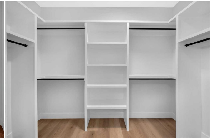
824 21 Ave NW, Calgary, AB

White regions are excluded from total floor area in GUIDE floor plans. All room dimensions and floor areas must be considered approximate and are subject to independent verification.