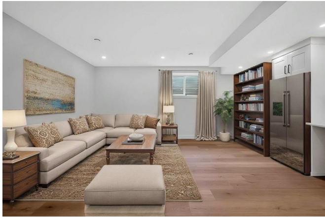
824 21 Ave NW, Calgary, AB

Upper Floor Exterior Area 1090.29 sq ft Interior Area 975.44 sq ft