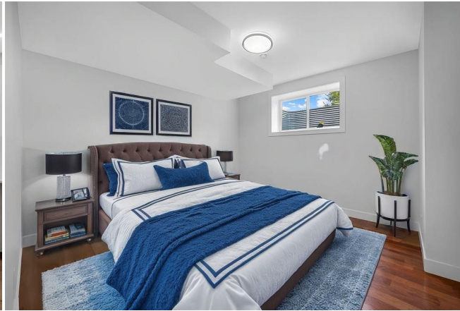
824 21 Ave NW, Calgary, AB

White regions are excluded from total floor area in GUIDE floor plans. All room dimensions and floor areas must be considered approximate and are subject to independent verification.